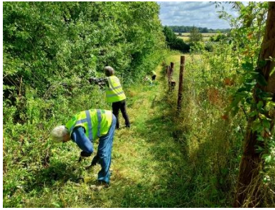
Homeward bound, job done.