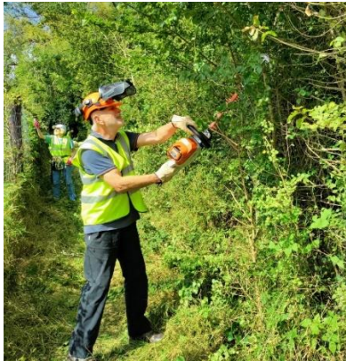
The new light-weight extendable pruner