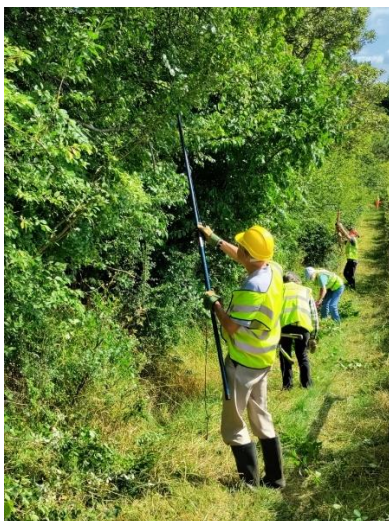
Clearing lower level vegetation with pruning saw and loppers